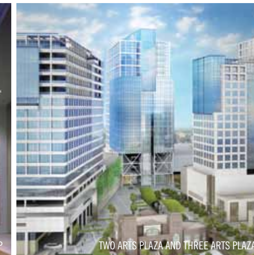
TWO ARTS PLAZA AND THREE ARTS PLAZA