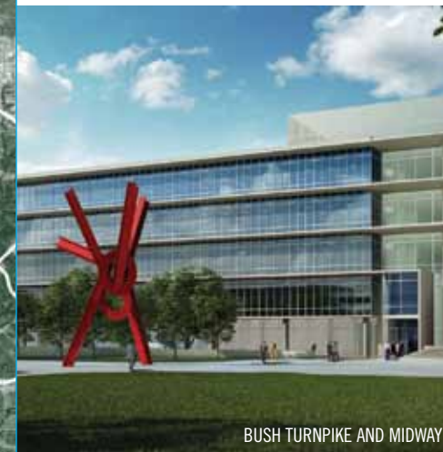
BUSH TURNPIKE AND MIDWAY