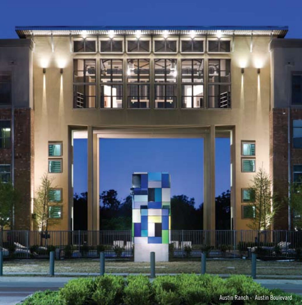
Austin Ranch - Austin Boulevard