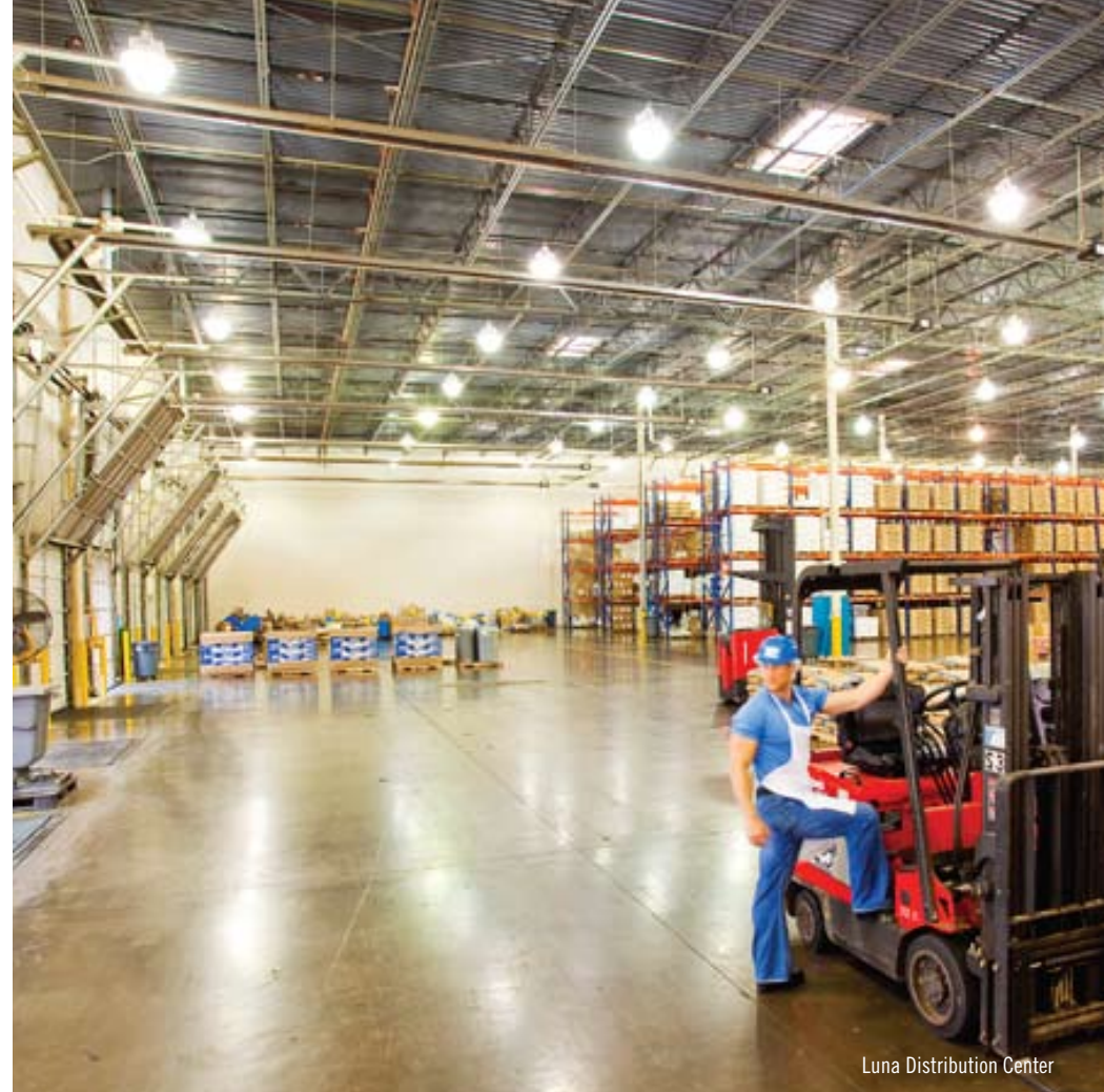
Luna Distribution Center