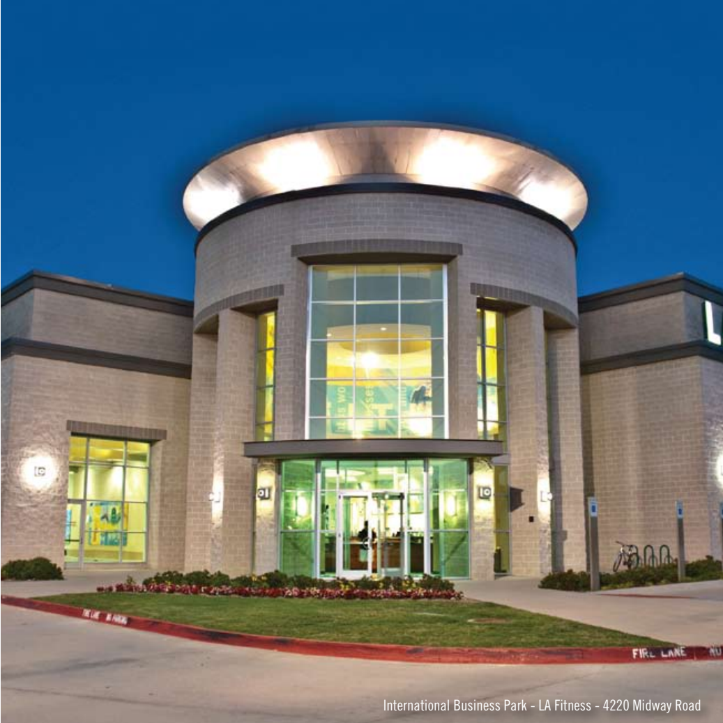
International Business Park - LA Fitness - 4220 Midway Road