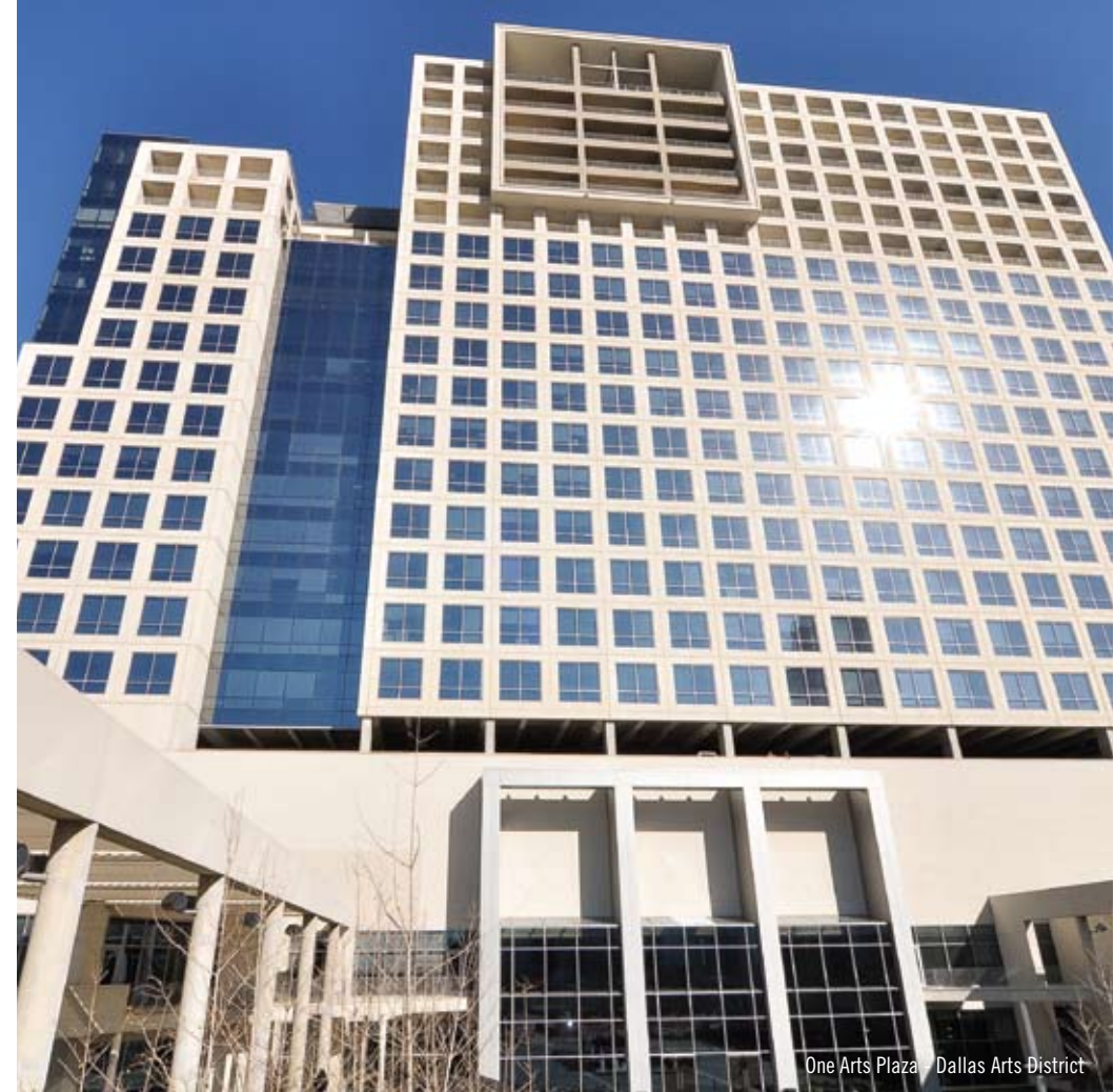
One Arts Plaza - Dallas Arts District